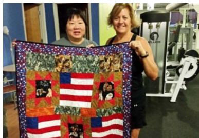
Jingle Bell Jog